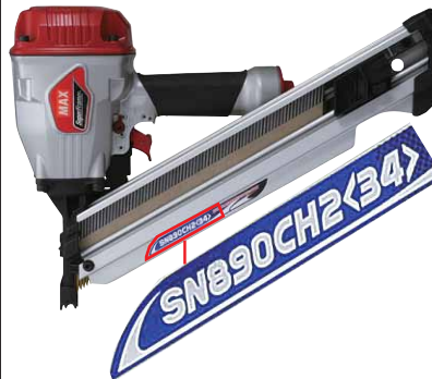
Blue sticker on the nail magazine contains "SN890CH2<34>"