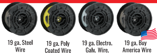
19 ga. Steel Wire